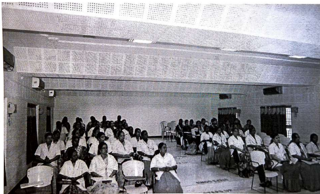
Awareness programme about "Provisions of Act for Women"