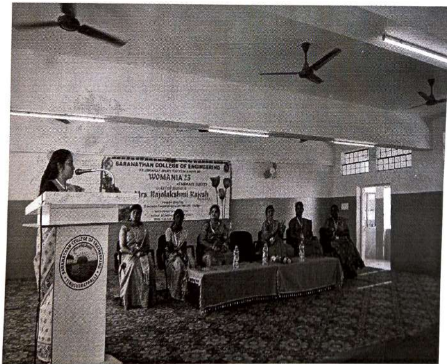
International Women's day celebration – Womania'2023