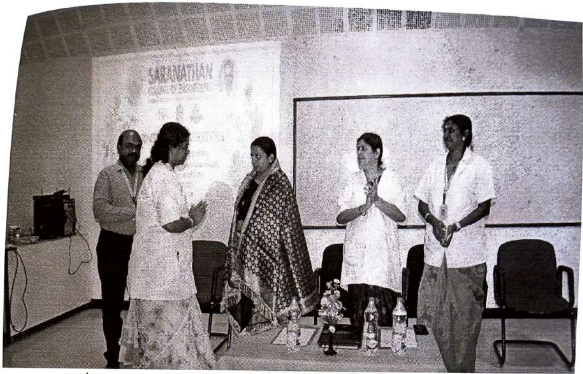
Awareness programme about “Provisions of Act for Women”