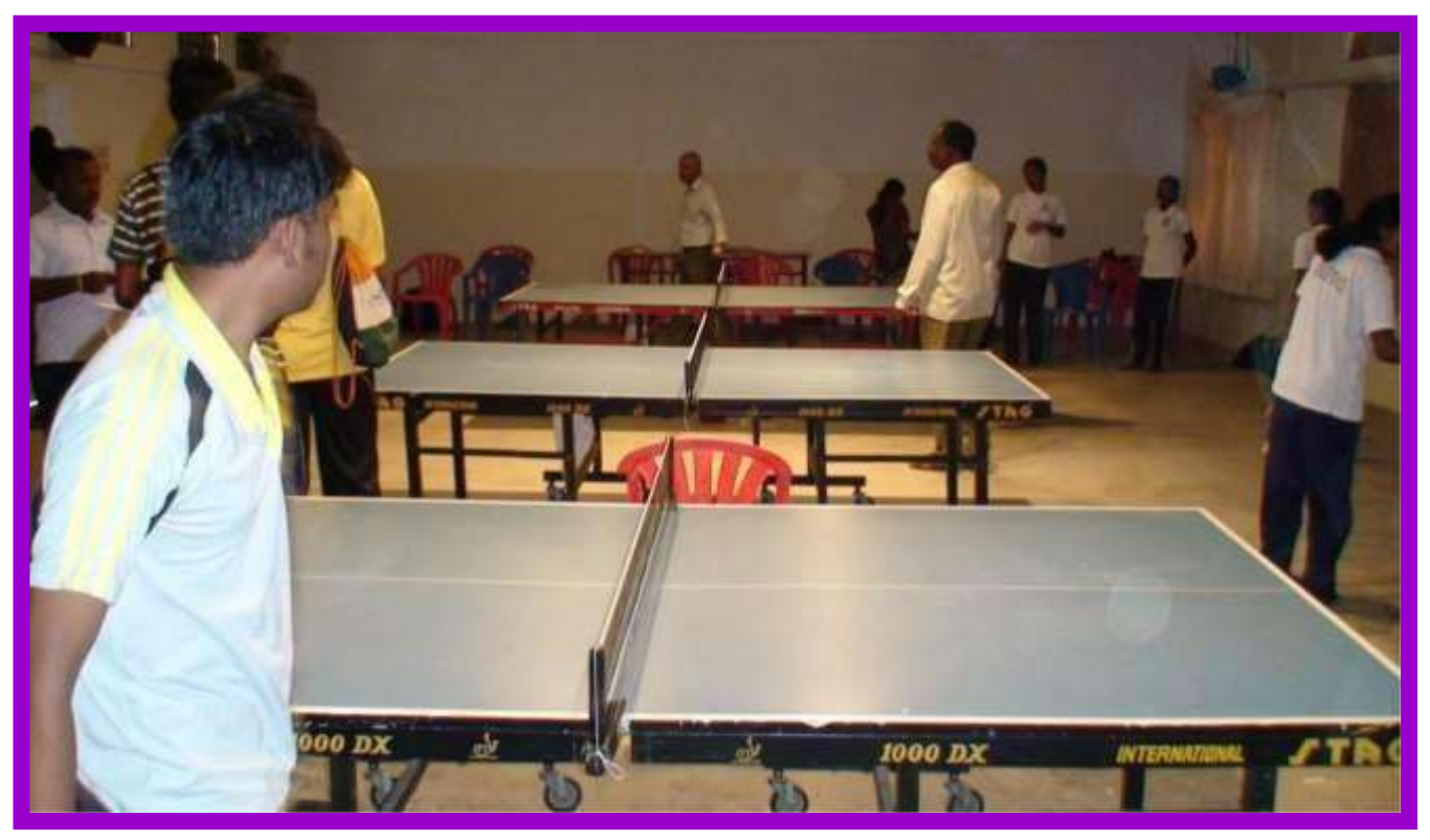
TABLE TENNIS TOURNAMENT